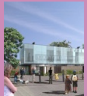
Eveline Lowe Primary School