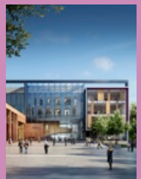
Oxford Brookes University