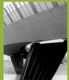
Shanks Millennium Bridge