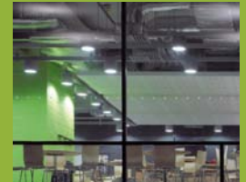
University Centre - UoW