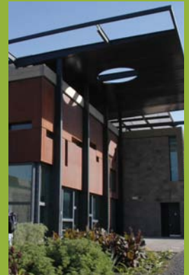
New British Embassy Yemen

Design Architect for Tanbridge House School, West Sussex. (RIBA Downland Trust Award 1994 and British Steel Award 1994)